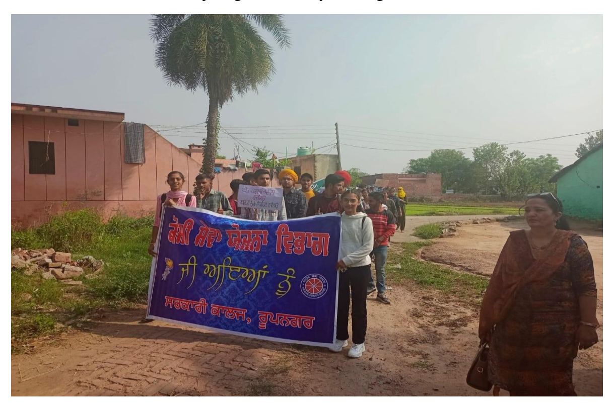
Students And Teachers Participating In The Rally In The Villages