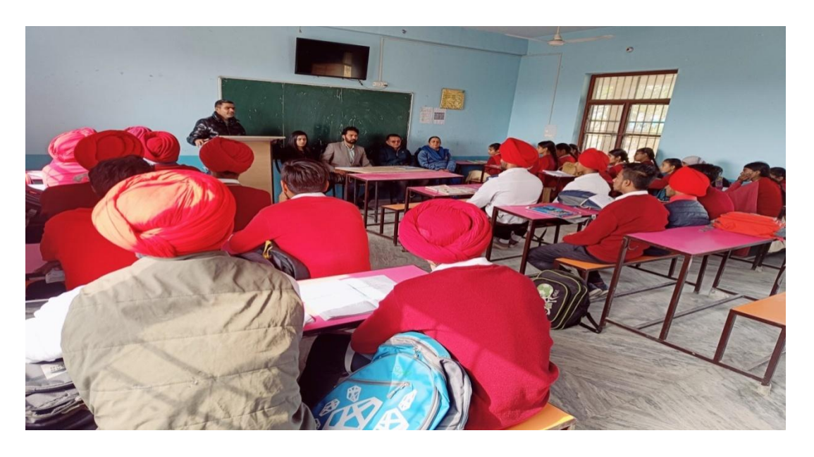
Professors Visit To Government Senior Secondary School, JhallianKalanRopar