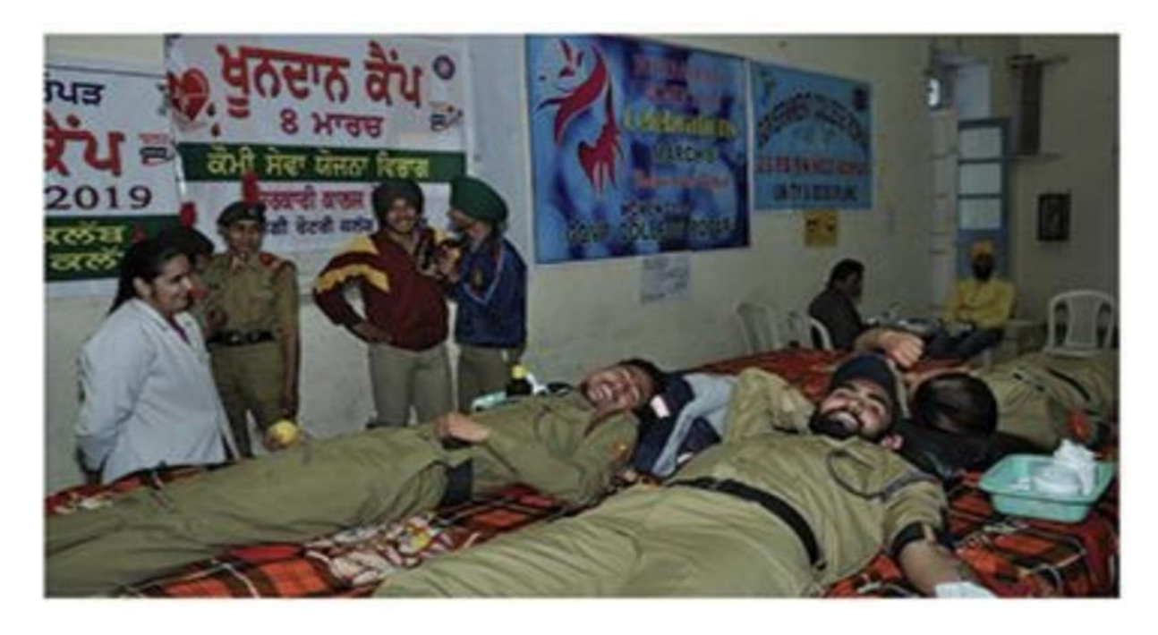
Students and NCC Cadets of the College During the Camp with Staff of Civil Hospital