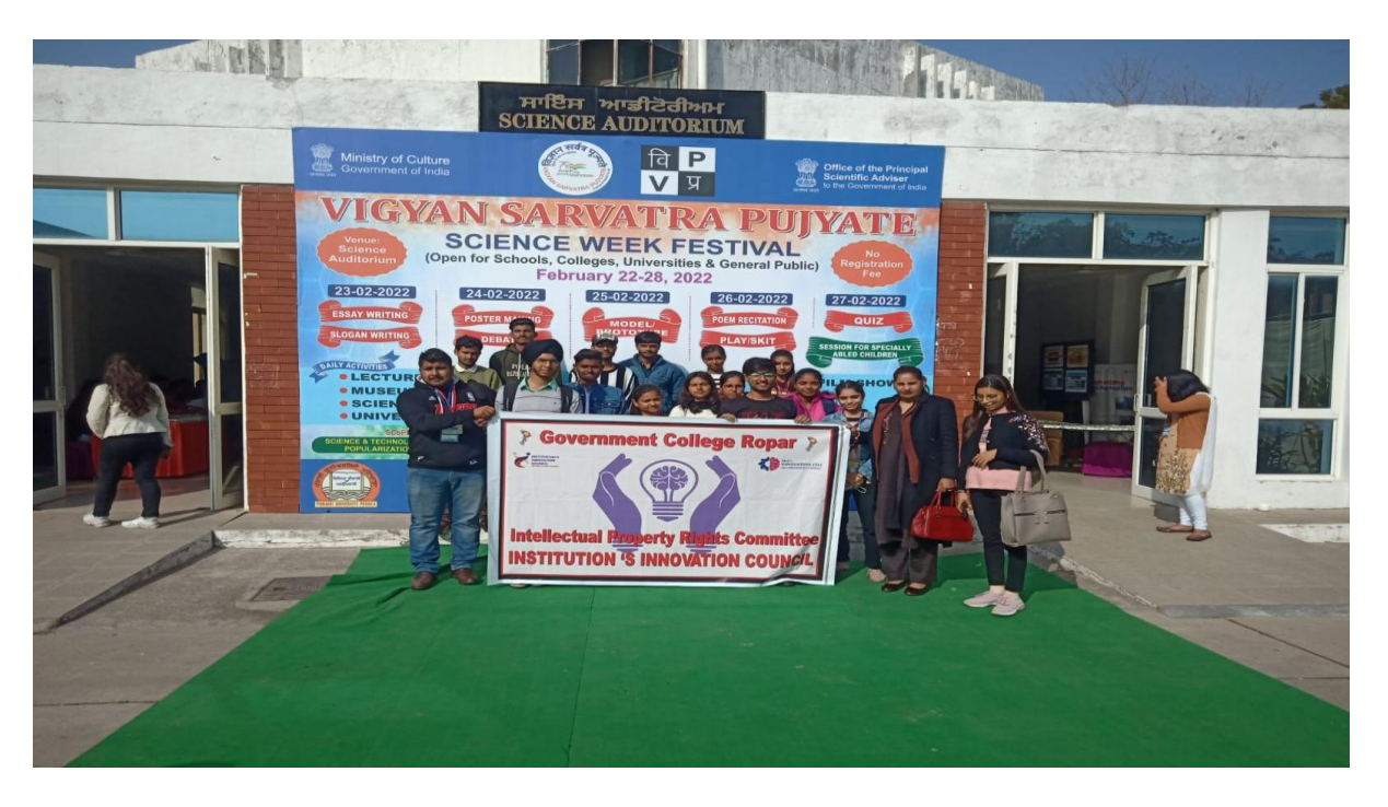
Students and faculty members during the event