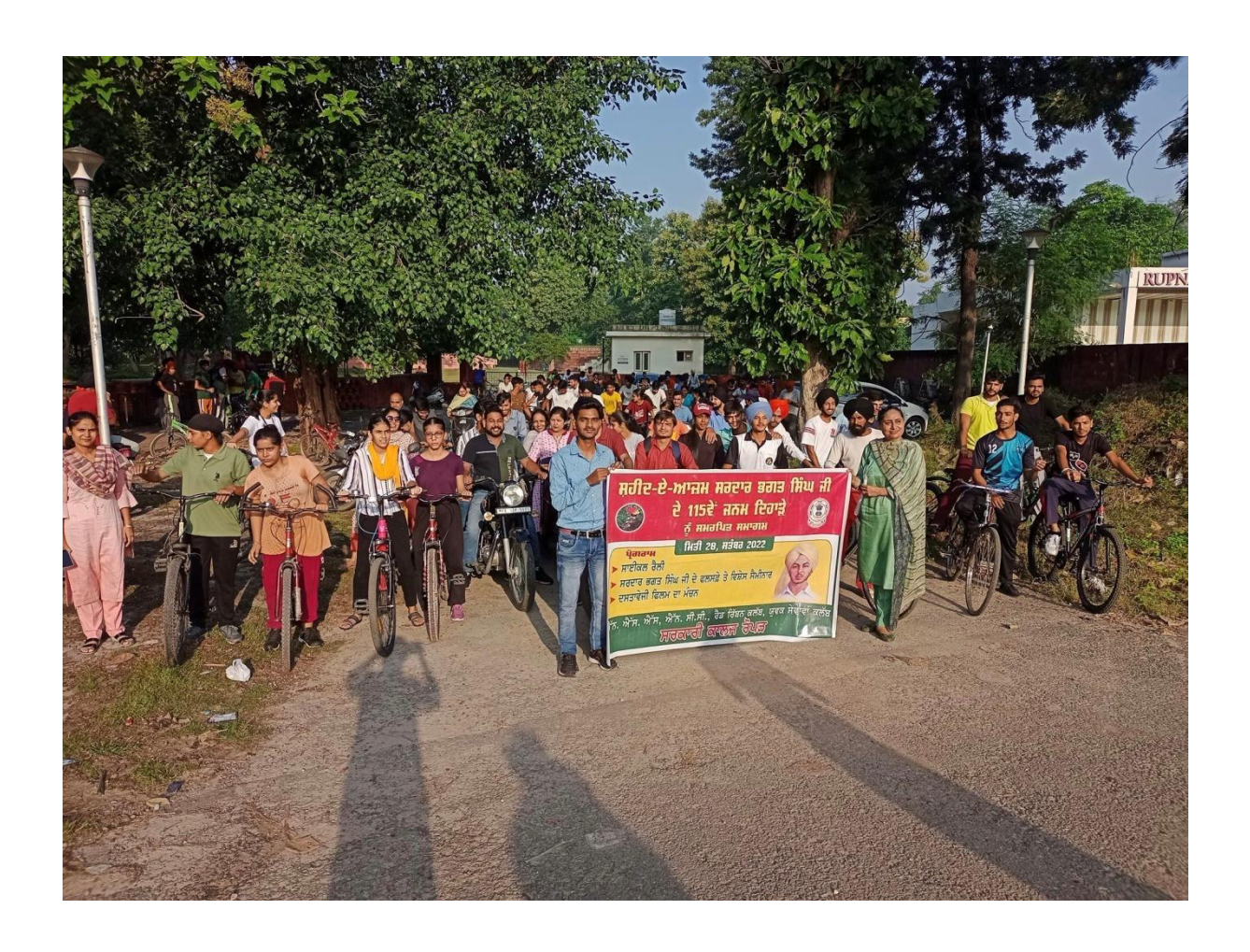
Students And Staff Participating In Cycle Rally