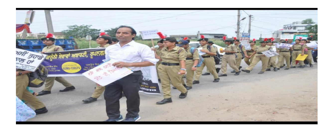
Students And Teachers During The Awareness Rally To Sensitize The Community Regarding Water Conservation