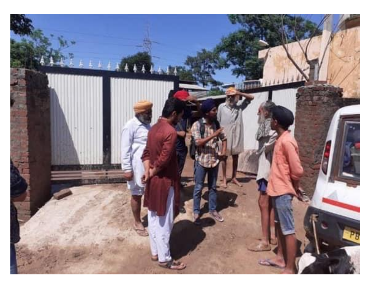
Students During The Home To Home Visit In Flood Affected Villages