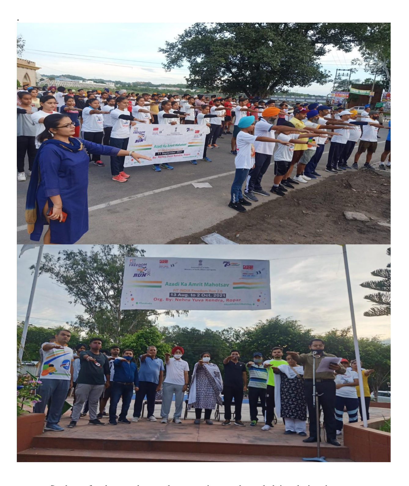
Students, faculty members and community members pledging during the event