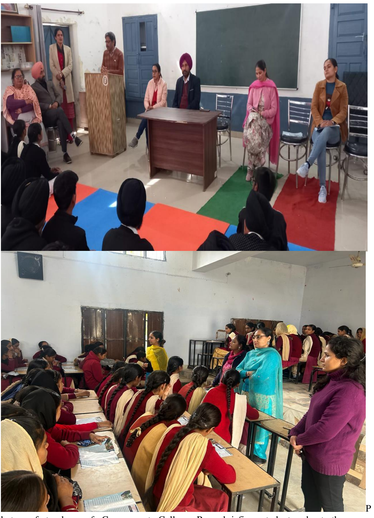
hotos of teachers of Government College Ropar briefing students about the career opportunities after higher education