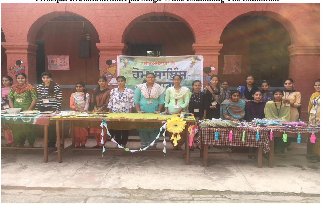
Exhibition By The Students