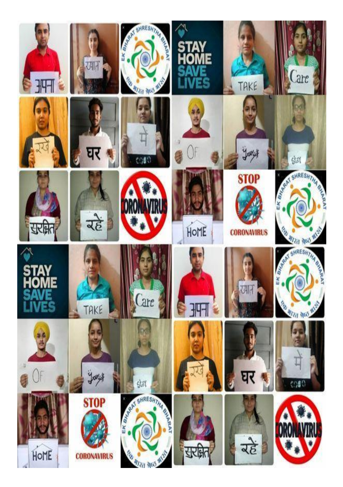
Students showing their slogans to keep safe from Covid-19.