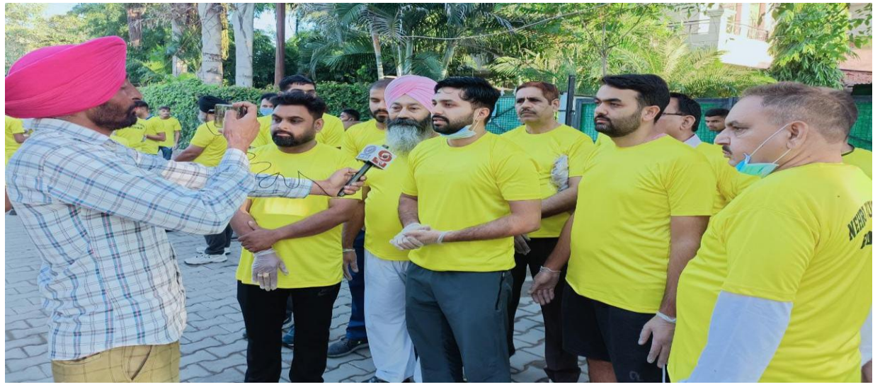
Students and other volunteers during the cleanliness drive and interaction with media