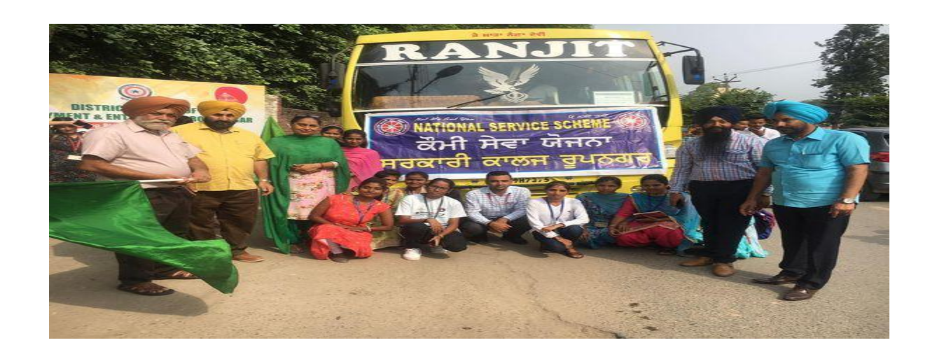
Students And College Staff Getting Ready To Visit Village To Spread The Awareness.