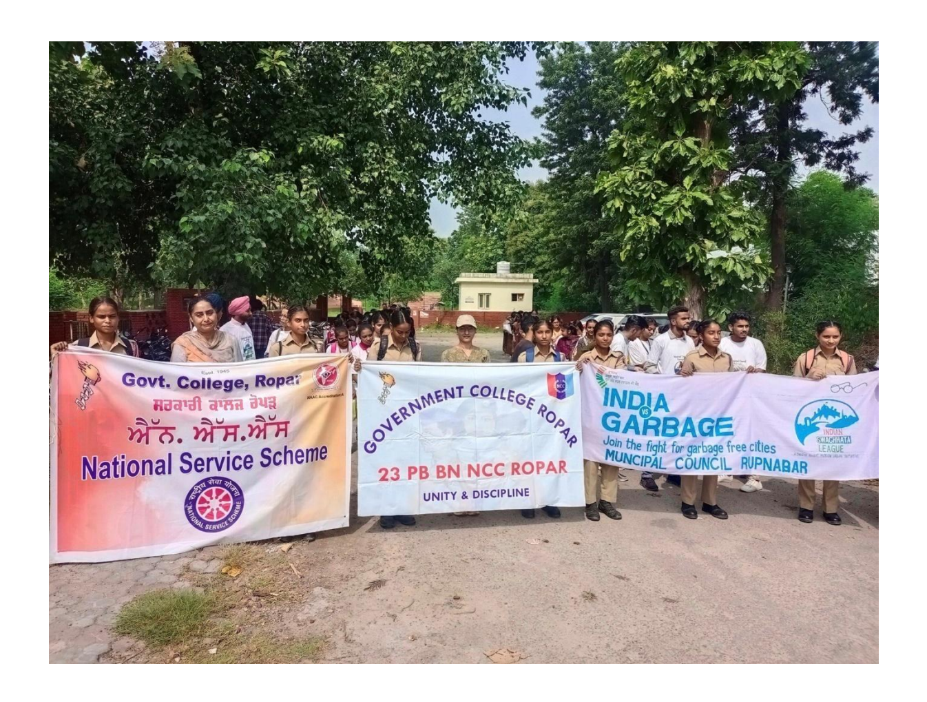
Student And Staff Organizing A Rally On Sawchh Bharat.