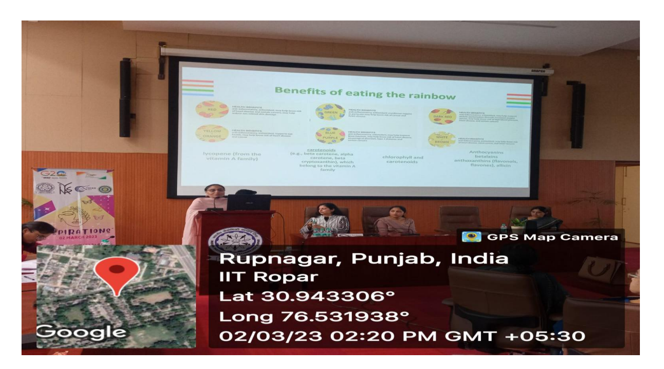
Photos of students and faculty members at IIT Ropar during the event