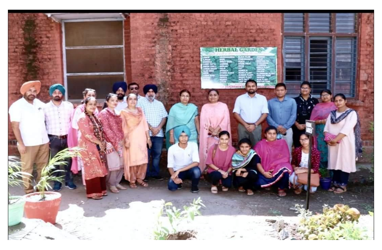
Tree Plantation in the herbal garden