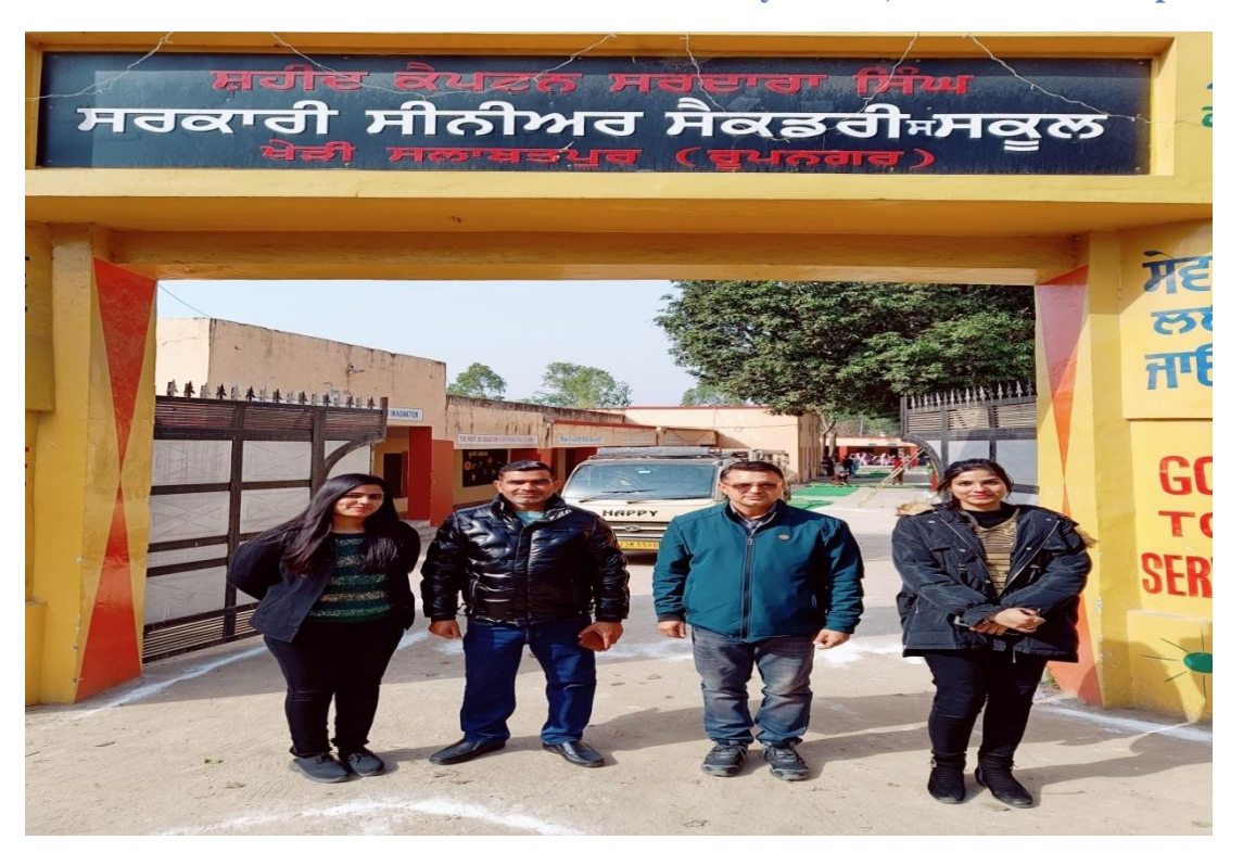
Professors During Visit To KheriSalabatpur Senior Secondary School