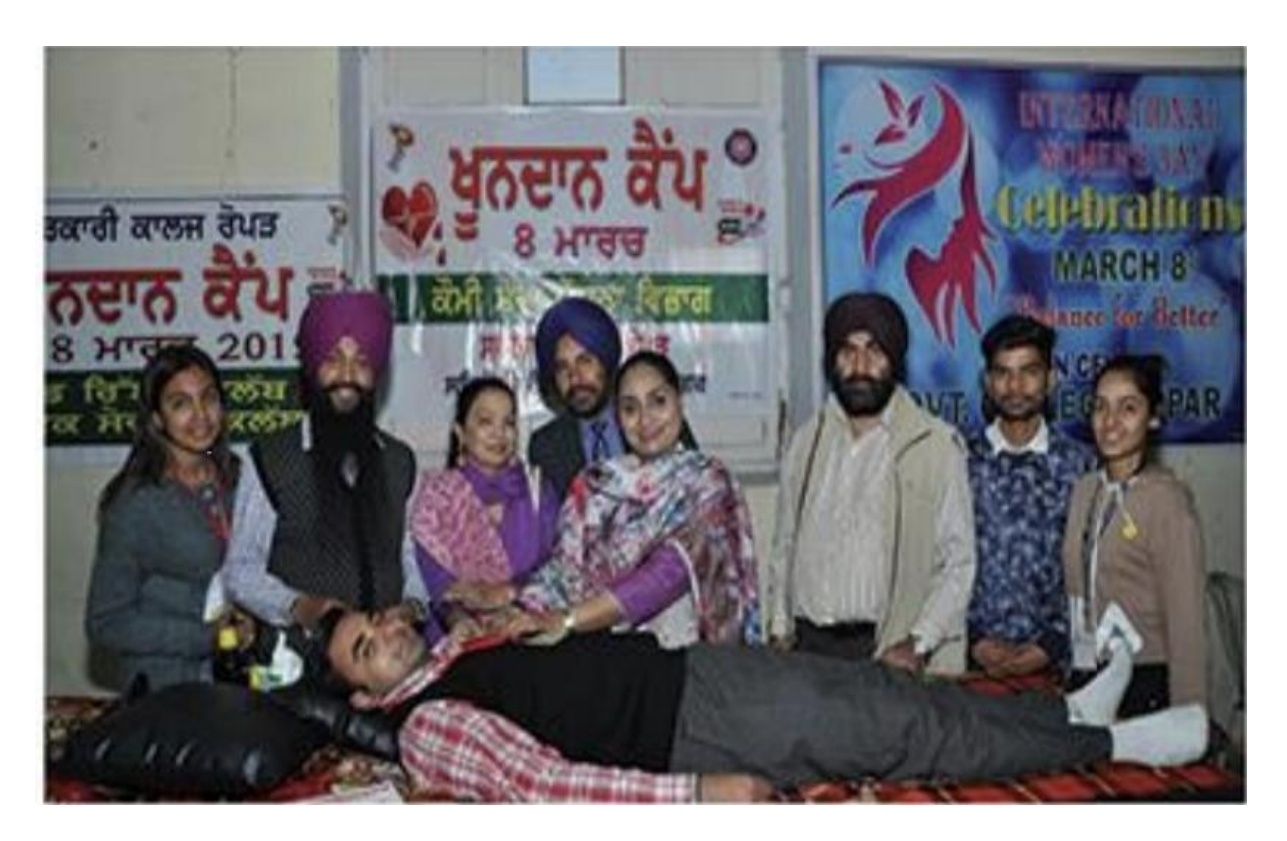
Teachers Donating the Blood During the Camp