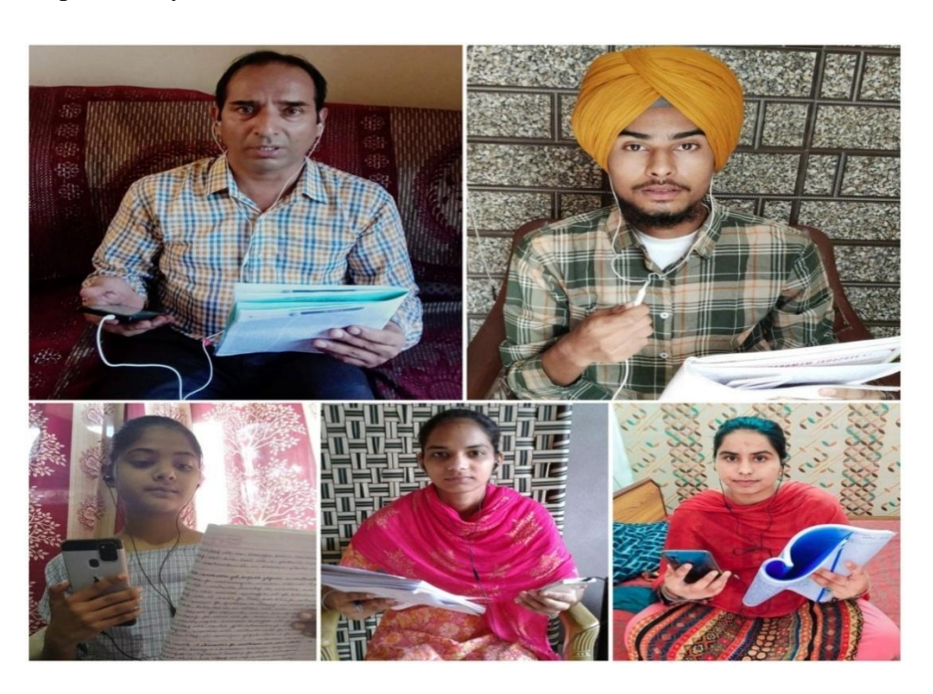
Online webinar on drug abuse prevention and rehabilitation

The chetnanashavirodhi group of College organized a comprehensive campaign to combat drug abuse and raise awareness about its consequences. This event included educational workshops and an impactful street campaign that reached not only the college community but also the city's streets and neighbouringareas. The day began with informative workshops and sessions focused on illuminating the dangers of drug abuse. These sessions aimed to equip individuals with a deep understanding of the physical, mental, and societal repercussions of substance addiction. However, the event went beyond the classroom. Students from the college took to the streets of the city and neighbouring communities, organizing rallies and awareness walks. They displayed banners and placards with anti-drug messages, effectively engaging with citizens outside the college campus. This event emphasized the college's dedication to combating drug abuse and spreading awareness. By actively participating in street campaigns, students extended their influence beyond the academic realm, reminding the community of the collective responsibility to address this critical issue.