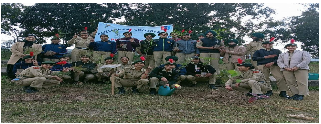
Students at The Bank Of Satluj River

The tree plantation drive not only enhanced the beauty of the riverbank but also contributed to the college's outreach efforts for the betterment of society. In summary, this tree plantation event along the Satluj River exemplified Government College Ropar's dedication to societal welfare, demonstrating how educational institutions can extend their influence beyond the campus to create a positive impact on the environment and the community.