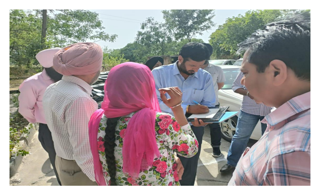
Students interacting with officials and community members