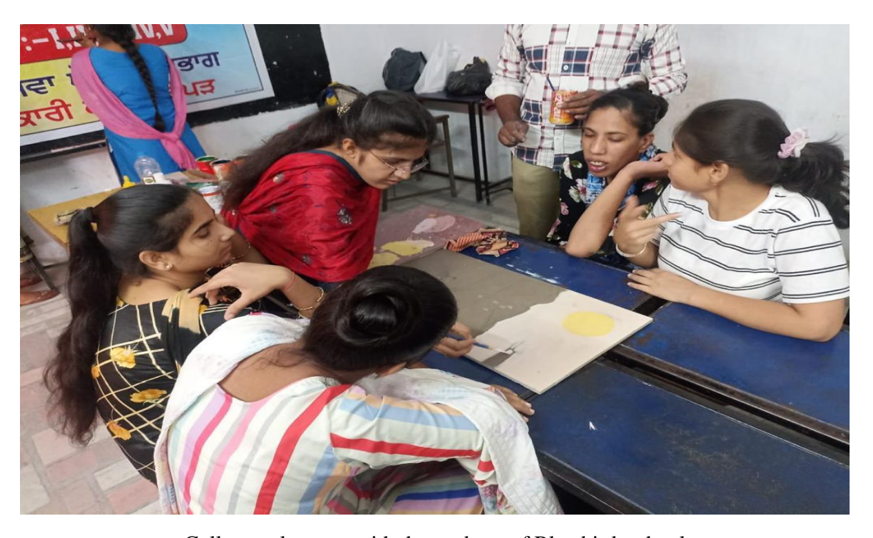
College volunteers with the students of Blue bird school