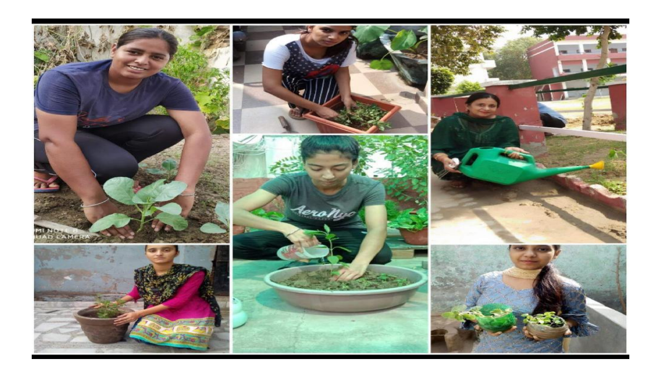
Students planting trees in their kitchen gardens and the neighbouring community