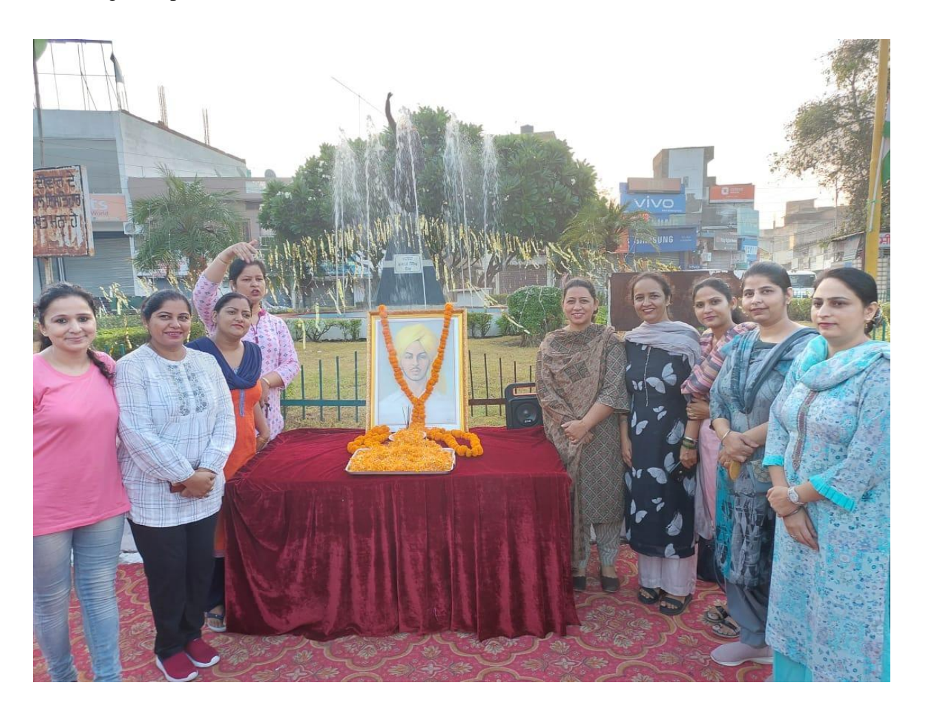
Students And Staff Organizing A Rally On The Occasion Of Shaheed Bhagat Singh's Birth Anniversary

In continuation of the commemoration activities for Shaheed Bhagat Singh's birth anniversary, Government College Rupnagar organized an Anti-Corruption Awareness Rally on November 2, 2022. This event, orchestrated by the NSS unit, served as a meaningful initiative to engage with the community and raise awareness about the critical issue of corruption, reaching beyond the college campus.