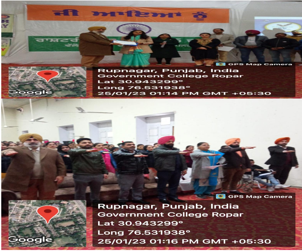
Photos of Pledge and Deputy Commissioner PreetiYadavacknowledging dedication and awarding the Faculty, Officials, and College Principal for Voter Awareness Initiative