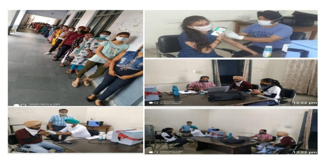
Hospital Staff and beneficiaries during the camp

This collaborative effort between Government College Ropar and the Civil Hospital of Ropar underscored the college's dedication to community health. It demonstrated a proactive approach in addressing the ongoing health challenges posed by the pandemic and emphasized the importance of collective action for the betterment of the community at large.