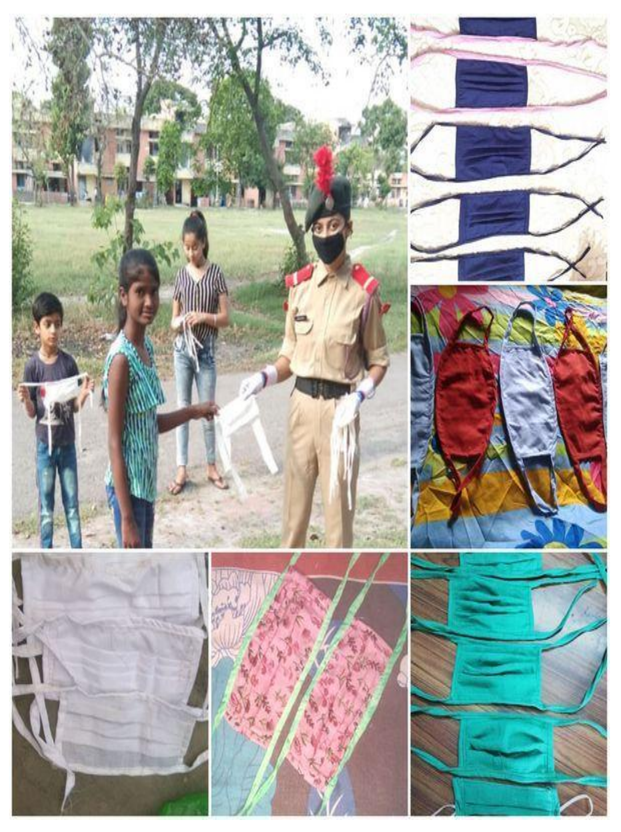
Students Distributing Masks To The Local People In Their Village. These Masks Are Prepared By The Students.