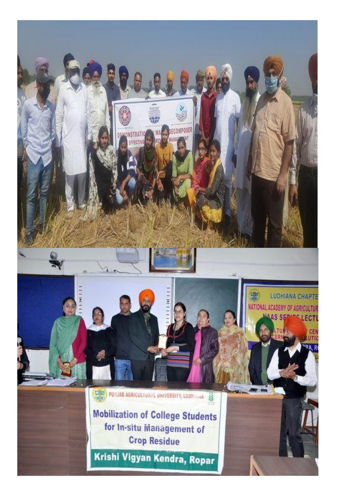
Student All College's Staff Visiting Farmers in Their Fields to have a conversation regarding the issue for better understanding of both parties