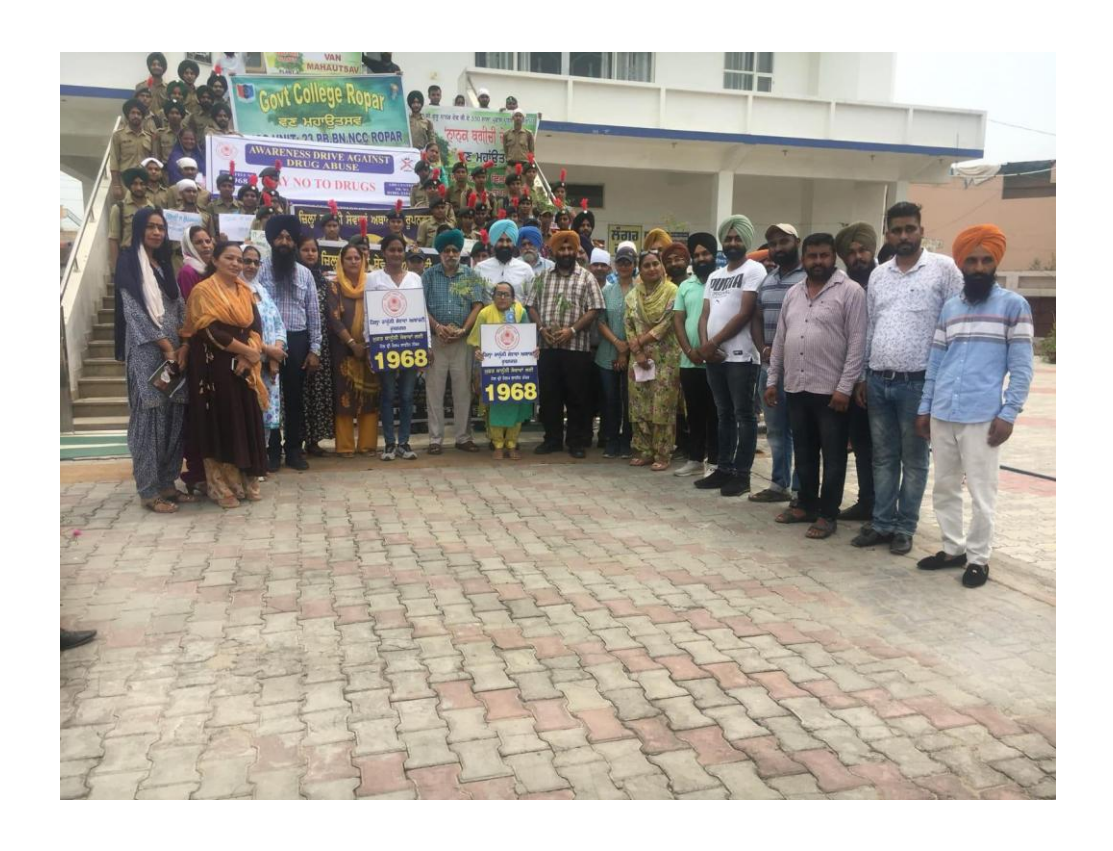
Students and Teachers Participating in The Rally in village Haveli